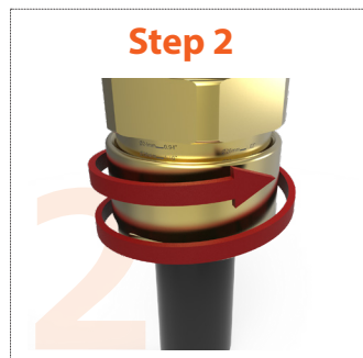
Step 2 Tighten backnut until a seal is formed onto the cable, then tighten one further turn