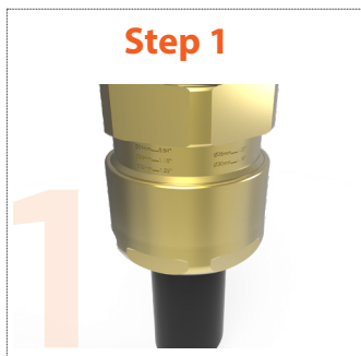
Step 1 Follow cable gland installation instructions until final stage – tightening of rear seal

The gland is permanently marked with various lines/numbers indicating the correct tightening level related to the cable diameter. Following the relevant cable gland Installation Instructions, the back seal should be tightened until a seal is formed on the cable outer sheath and then tightened one further turn.