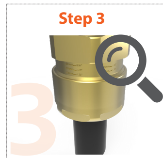
Step 3 The backnut should be level with the marking guide corresponding to its diameter – this can be visually inspected and adjusted as necessary

Note: The cable gland installation instructions have a printed cable OD measure for if the cable OD is not known